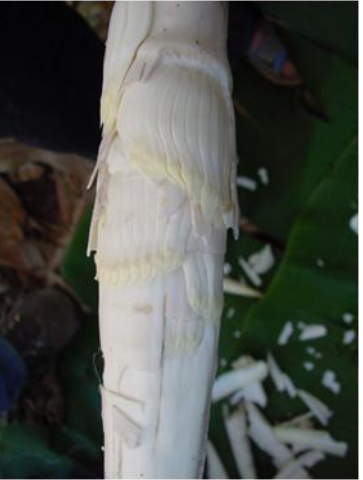
Figure 2: Banana flowers on an influorescence.

inflorescence remains erect after emerging from the pseudostem, but generally it bends downward to produce upside down pendant fruit bunches. A banana inflores-