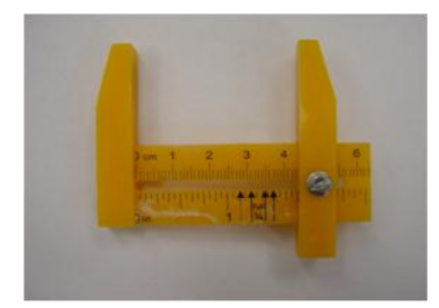
Figure 3: Banana calliper.

maximum diameter is 36 mm ( 1\frac{1}{16} inch or 44 thirty seconds of an inch). Light three-quarter size ranges from 29-32 mm in diameter. Fruit with a calliper grade of over 37 cm (full size) should be handled with great care because the peel can easily split during handling. Such fruit should not be packed for export. Eating quality is determined by texture and flavour (sweetness and aroma), and is unfavourably affected by starchiness and off-flavours. Visual quality is determined by colour, size, shape, gloss and freedom from outwardly visible