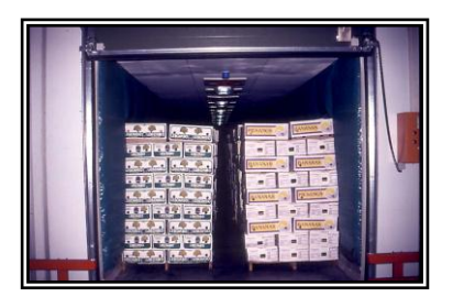
Figure 6: Forced-air ripening room.

forced-air (pressure ripening) is by far the most reliable way of ensuring that the product temperature remains constant and that ethylene is distributed evenly through the boxes. Ripening rooms must be