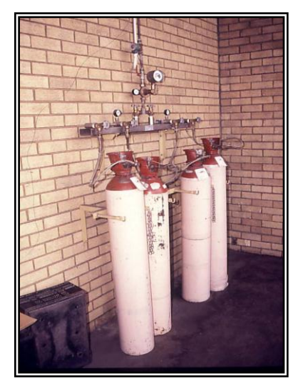
Figure 8: Pressurized ethylene gas cylinders.

As soon as the product has reached the desired ripening temperature, ethylene is released into the ripening room from pressurized gas cylinders or a generator that converts ethanol to ethylene. Ethylene stimulates fruit ripening at concentrations ranging from 0.1 to 1.0 \mu L L<sup>-1</sup>. However, the ethylene concentration in the ripening room is set